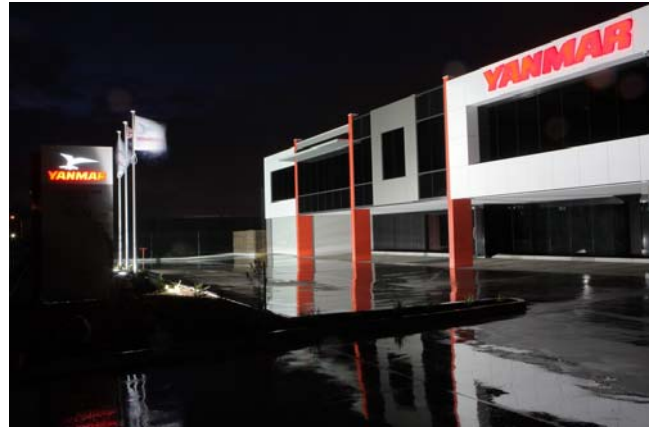
Above - Power Equipment HQ in Lynbrook VIC

In four out of the five market segments where Yanmar is active, Yanmar is the market leader in three of these. In Marine, Yanmar's market share is 33.06%, 20.38% in Industrial, 56.28% in Agriculture and 35.46% in Power Generation.